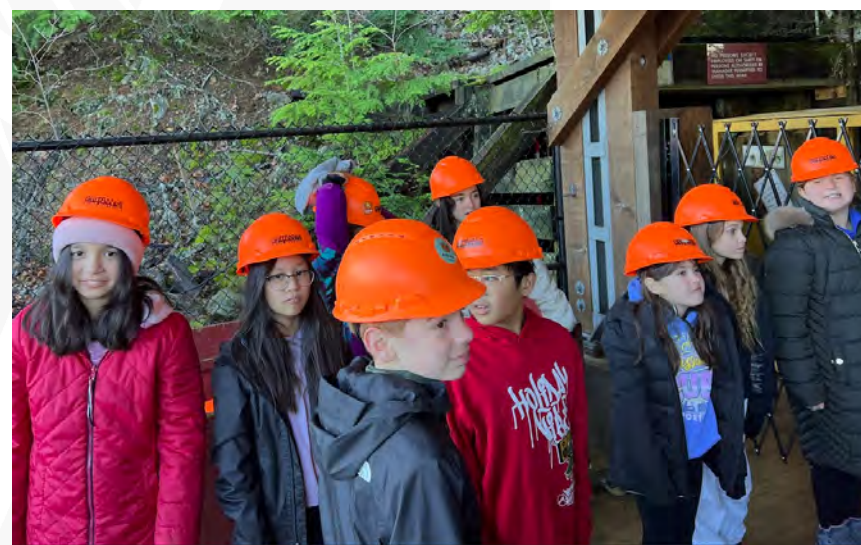
Grade 5 at Britannia Mine Museum